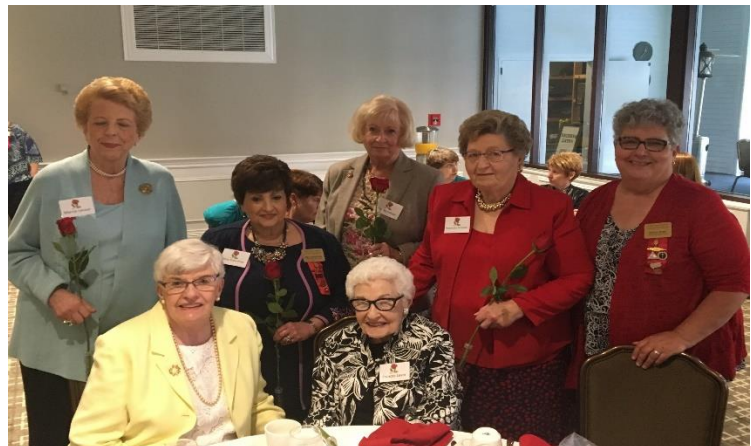
Key Woman Educators working together for many years as DKG Sisters.