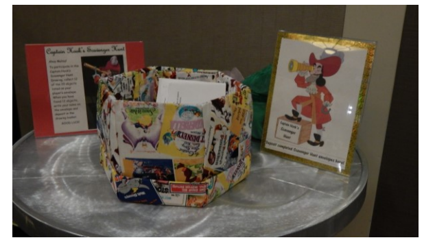
Captain Hooks Scavenger Hunt