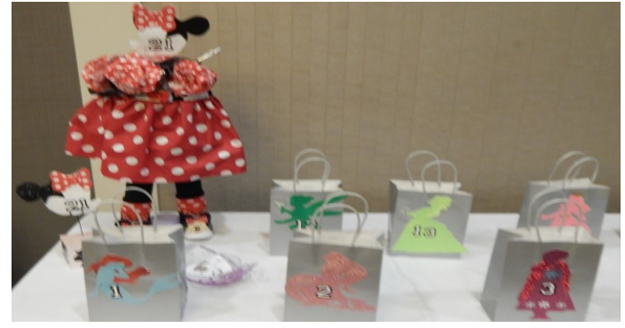
Princess Centerpiece Raffle